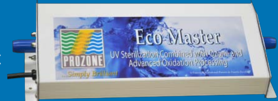
Eco Master for Residential Pools