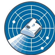
CleverClean™ scanning system