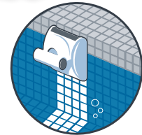
Water line Cleaning