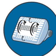
Extra Active Brushing